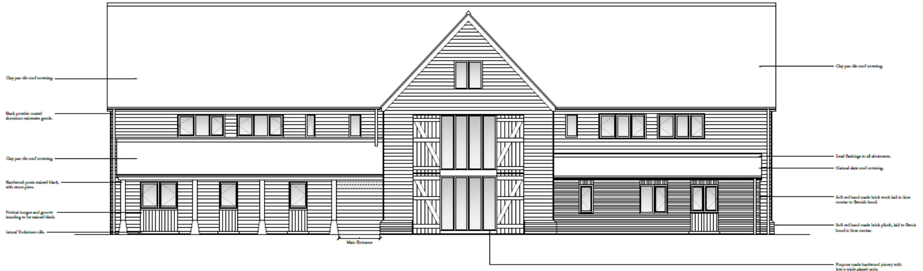
FRONT ELEVATION (NORTH FACING)