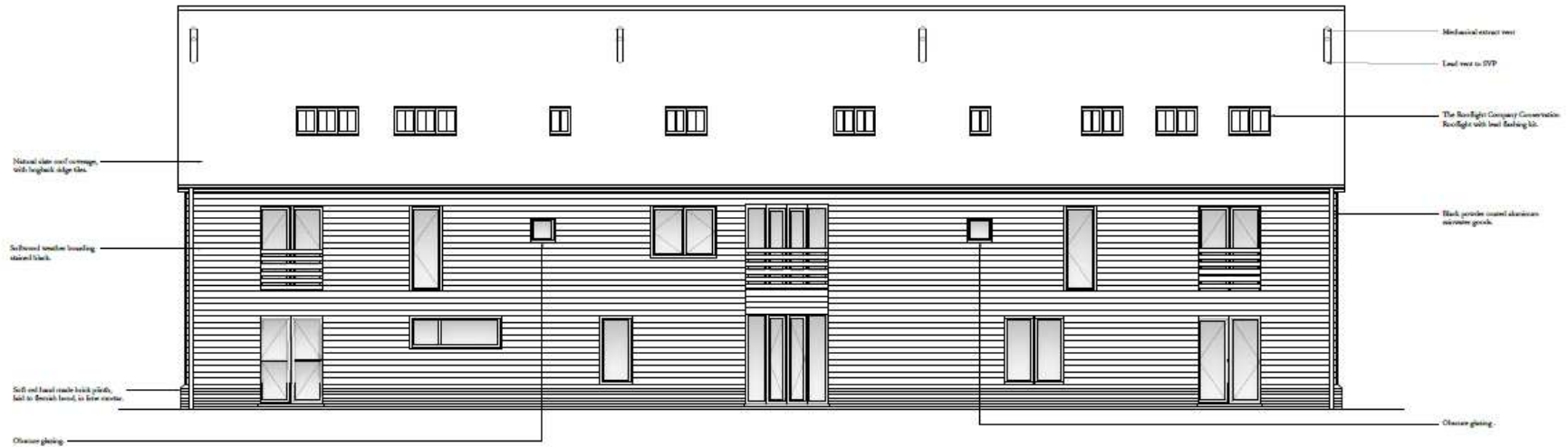
REAR ELEVATION (SOUTH FACING)